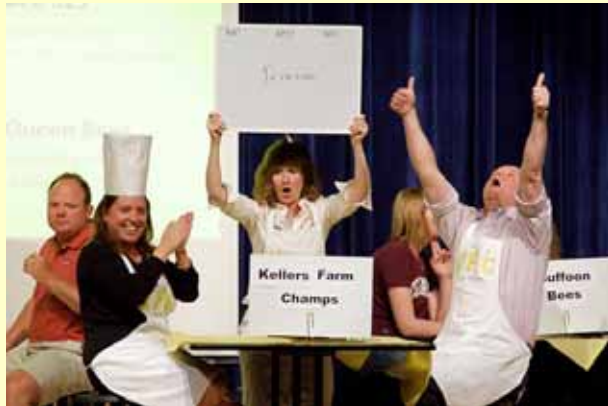
KFC (neighborhood team)