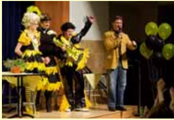
The Show Bees (teacher team & winner "Best Costume 2009")

Team Sponsor: $300 Sponsor 3 teachers (a whole team) for $300 or sponsor an individual teacher for $100.