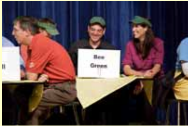
Bee Green (an Easton club team)

3 adults per team (high school age & older)