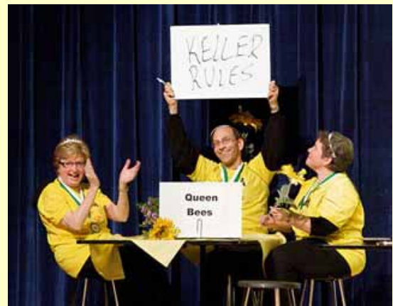
Queen Bees: 2009 Trivia Bee Winners